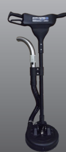
Evolution RX12 # 000-163-790