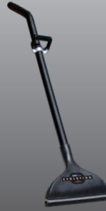
2" Flood Extraction - 16" head # 000-163-058