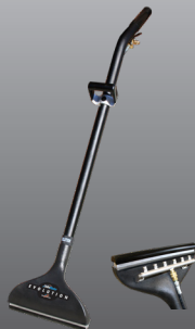
2" 16" head, 6-jet # 000-163-035