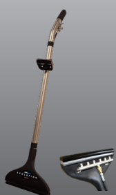
2" Titanium 16" head, 6-jet # 000-163-054

HydraMaster took wand and tool design to the next level with the EVOLUTION Wand Series. By using a copolymer process to rotationally mold cleaning wands and handles our tools that are lighter, more durable, and outperform traditional wands and tools. Through scientific testing, the EVOLUTION Wand series was designed to smooth airflow and boost water recovery performance. The laminar airflow design improves airflow, increases extraction performance, and reduces drying time.