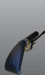
4" Glided Upholstery Tool # 000-163-617