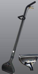
1.5" 13" head, 2-jet # 000-163-034